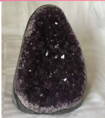
Crystal Geode (Representation)